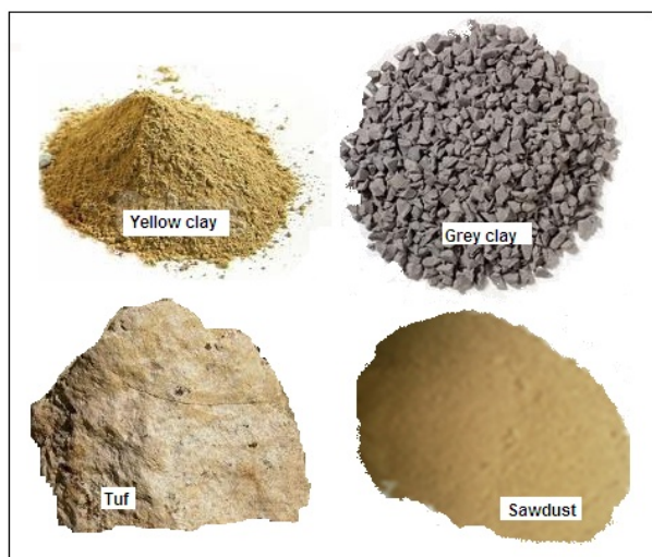
Fig. 1 Raw material

Sawdust and clay used in this study is categorized as Eucalyptus and Pine Alep-Mixed in terms of their particle sizes. Fig.1 shows the raw materials used in the fabrication of bricks samples.